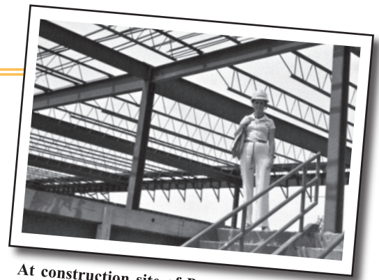
At construction site of Potomac High School, June 1979.